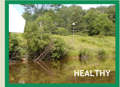
Mowed lawn 30+ feet from the water