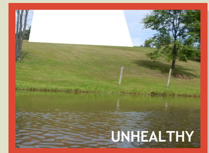
Mowed lawn within inches of the water

Interested in improving your shoreline? Contact Biological Services for tips!