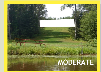
Mowed lawn 3 feet from the water